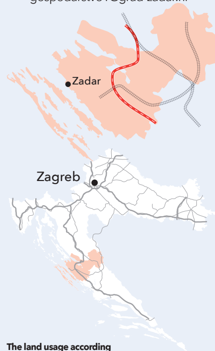
The land usage according to the spatial plans

Contacts City of Zadar, e-mail: gradonacelnik@grad-zadar.hr , www.grad-zadar.hr , Economics and Crafts Department, phone: +385 23 208 122, fax: +385 23 208 195, e-mail: gospodarstvo1@grad-zadar.hr