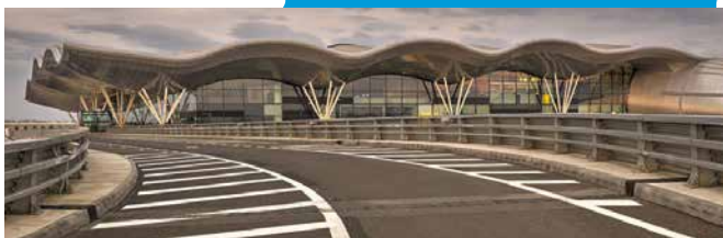
PROJECT: FRANJO TUĐMAN AIRPORT ZAGREB

Only Public Authorities are authorised to initiate PPP projects.