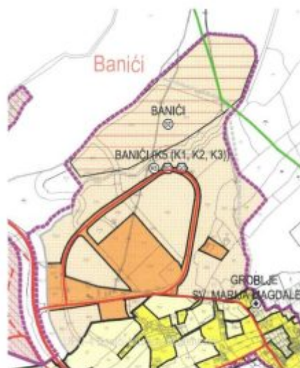
Shematski prikaz sa oznakom parcela