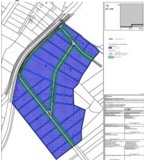
Diagram of the zone