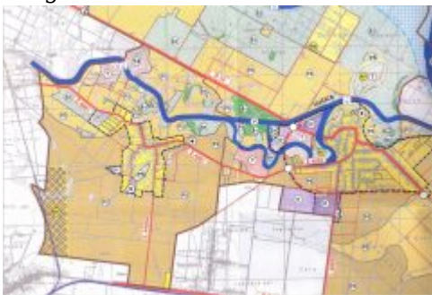
Diagram of the zone

Scanned copy of cadastral plan extract with highlighted available lots