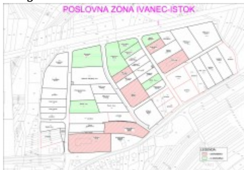
Diagram of the zone